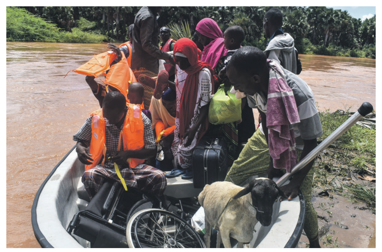
Villagerss of Onkolde and a goat being evacuated by a Kenya's Red Cross boat from their flooded village after the Tana River overflowed in coastal region of Kenya

Finally, in addition to an inclusive social protection system, having the necessary skills to feel ready and prepared for climate change disruptions is key, so that persons with disabilities and their families can be part of climate adaption and mitigation plans of their community and country. 56% of the respondents to the survey that gathered data for this paper highlighted their concerns about not having the necessary skills and knowledge to feel ready and prepared for climate change disruptions. 22% of the respondents considered themselves to have skills and knowledge and other respondents either didn't answer or didn't know the answer to this question.