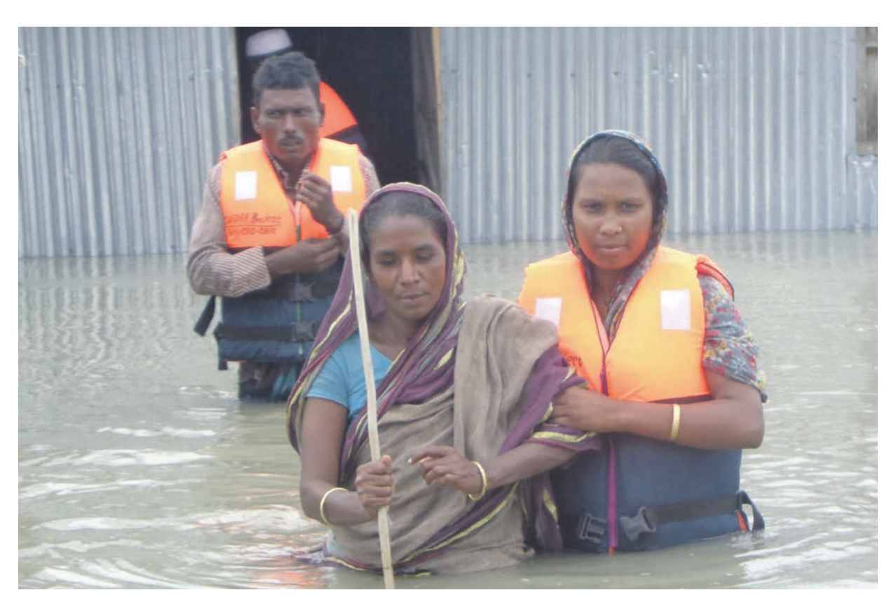
Community response to flooding in 2015

The impact of such disruption experienced by all people who have been displaced or who are left with no choice but to migrate is significant on psycho-social well-being. For persons with disabilities, the impact is disproportionate. They are, for example, facing lack of accessible transport and services while on the move, and not able to access services in countries of relocation.<sup>xxii</sup>