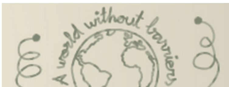
Image 1: A world without barriers: International Disability Alliance

Disability includes the intersection between long term impairments which may be sensory (like vision impairment) physical, intellectual or psychosocial and barriers which may be physical (like stairs) or attitudinal (like stereotypes). According to the 2011 World Report on Disability, around 15 per cent of the global population or more than one billion people have disability. Unfortunately, many environments and buildings including public facilities like courthouses or schools have not been built with inclusion in mind. As new buildings are going up and new technology being developed it is important that accessibility and inclusion barriers are removed and that new designs and investments are accessible from the beginning. With this in mind, public procurement processes and systems need to be urgently reviewed to create a 'barrier free world'.