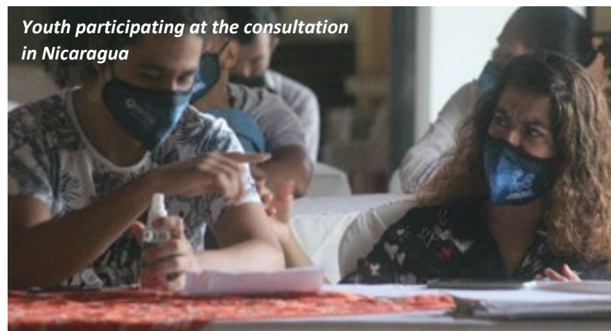
Youth participating at the consultation in Nicaragua

The GDS is a participatory process, in which governments, multi-lateral agencies, international organizations, organizations of persons with disabilities and other stakeholders convene to