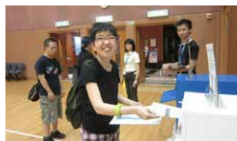
A young woman simulating casting her vote in the lead up to elections in HK