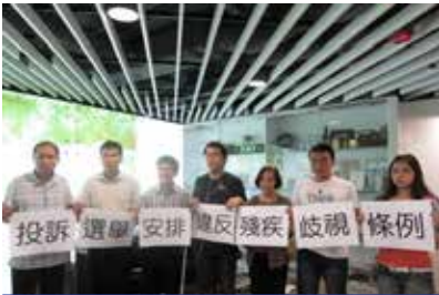
Chosen Power representatives at the Registration and Electoral Office holding signs which read: "The voting system violates the Anti-Discrimination Law"

In response to the complaint, we met with the staff of EOC who explained to us the Anti-discrimination Law. However, it was not easy for we self-advocates and parents to understand the specialised jargon and procedure of anti-discrimination law, the process of lodging a complaint, and how to fill in the complaint forms.