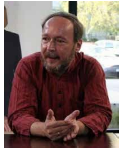
Gábor Gombos