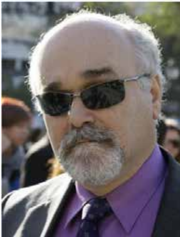
Yannis Vardakastanis

The International Disability Alliance (IDA) is proud to present the launch of its new journal - the IDA Human Rights Publication Series.