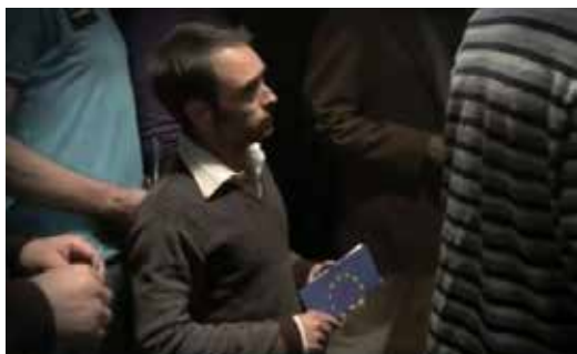
A young man in a queue waiting to cast his vote

In 2014, the European Parliament will hold its elections and DPOs should take the opportunity to mobilise Europeans with disabilities to exercise and assert their right to vote. DPOs can consult the EDF campaign 'Disability votes count' of the 2009 European Parliament elections.