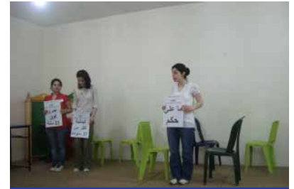
LASA training activities

Currently, LASA is negotiating with representatives of the Ministry of Internal Affairs to put safeguards into place to effectively and meaningfully ensure respect of the right to vote of persons with intellectual disabilities in Lebanon.