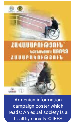
Armenian information campaign poster which reads: An equal society is a healthy society

After taking the course, one student commented, "We don't see persons with disabilities. Before we hadn't thought about these people, now we see they deserve the same social rights, rights to education and the electoral process. We shouldn't have a society where people are separated."