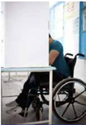
A polling booth for wheelchair users

Question 3: With the introduction of these legal instruments, were all the elements in place to guarantee the right to vote for all Tunisians with disabilities?