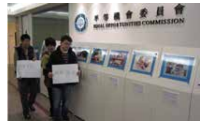
Chosen Power representatives at the Equal Opportunities Commission

Our advocacy did not stop at meetings and letters. Our second attempt to sensitise the Government took place on 17 December 2012 at the Legislative Council where we shared our concerns at the open hearing of the Concluding Observations on the initial report of China, as adopted by the Committee at its 8th session (17 – 28 September 2012). We gathered more than ten advocates of persons with disabilities to share our observations and recommendations after attending the CRPD Committee's 8th session. Five of our self-advocates took time off from their work and again voiced our rights to political participation.