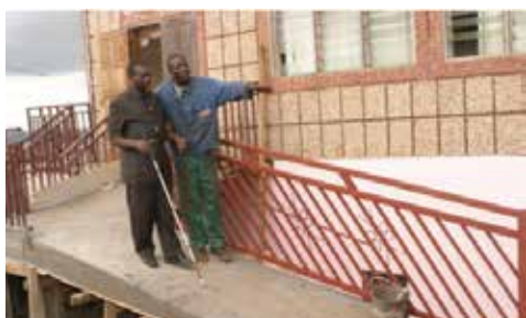
A blind man walking down a ramp with another man showing him the way

Twelve pilot polling stations were identified in five of the ten regions in Cameroon and were refurbished to accommodate all kinds of disability through the construction of ramps, improved lighting systems, provision of elections guidelines in Braille and sign language interpretation.