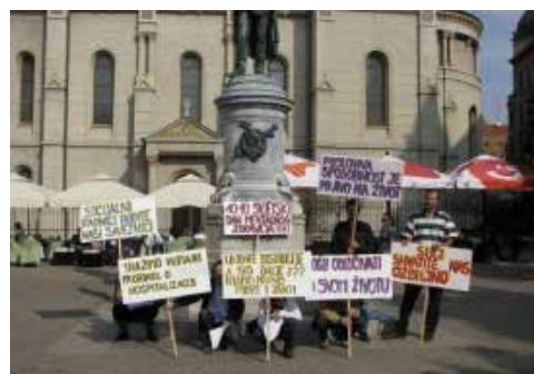
Mad Pride in the Flower Market, Zagreb

fully deprived of legal capacity to be recognised as voters without restrictions.