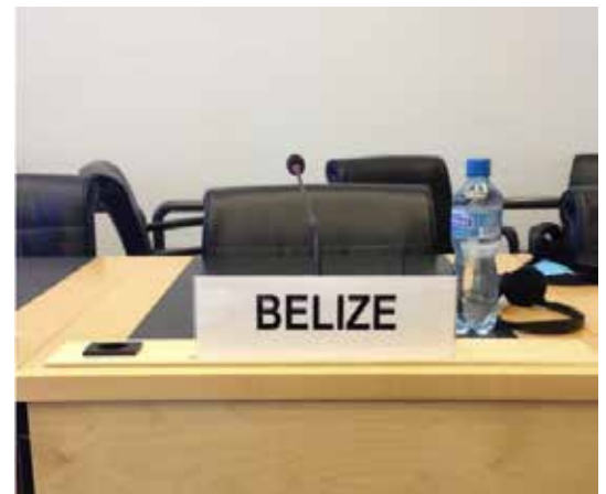
The Human Rights Committee reviewed Belize in the absence of a State report and in the absence of a delegation

stipulate the same disqualifications which were not raised during this "dialogue". The Committee asked in particular why being found to suffer from any variety of mental illness under any law in force in Belize is the appropriate standard for deciding if someone should be entitled to exercise the right to vote under Article 25 of the ICCPR. Naturally, no answers were provided to these questions.