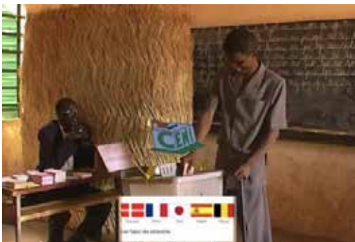
A man casting his vote