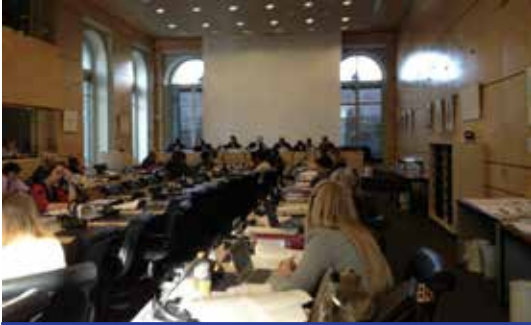
Human Rights Committee's dialogue with the Angolan government delegation

Although this did not address the right to political participation specifically, during the review, the Committee recognised that restrictions to legal capacity hinder the enjoyment and exercise of all rights, including the right to vote and stand for election. Accordingly, the Committee asked the delegation about Article 154 of the Constitution and Article 12 of the Electoral law which exclude from elections persons who are legally incapacitated and those detained in medical establishments based on their mental disability, submitting that these provisions constitute discrimination as considered by NGOs and the Human Rights Committee. More generally, the Committee enquired about the means put in place to implement the CRPD and eliminate discrimination, encompassing multiple forms of discrimination of persons