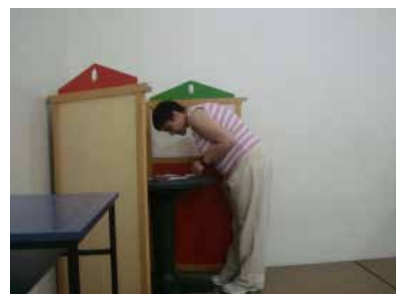
A woman simulating casting her vote