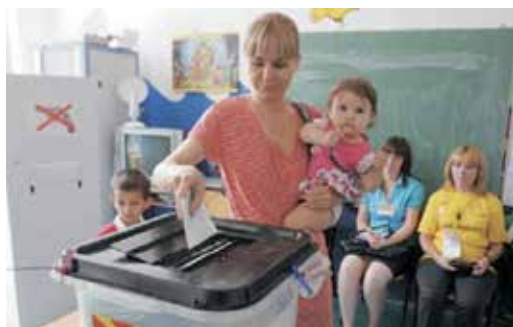
A mother votes in the June 2011 election in the former Yugoslav Republic of Macedonia.

Question 6: Recognising that the Human Rights Committee is a body of independent experts, what steps can be taken by the OHCHR, persons with disabilities and their representative organisations, to encourage the Committee to respond to your appeal to review General Comment no 25?