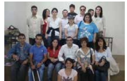
LASA trainers