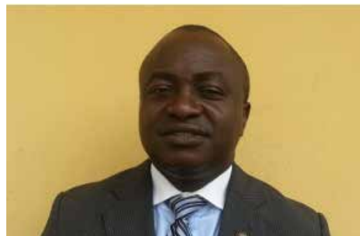
Joseph Oye © 2011 Sightsavers

Under the initiative of Sightsavers Cameroon, the 'Accessible Elections for Persons with Disabilities Project' (AEPD) was launched in 2010, in view of the Presidential elections of 2011, together with organisations of persons with disabilities (DPOs), in particular blind persons' organisations, and other key partners such as the UN Centre for Human Rights and Democracy in Central Africa (CNUDHD), UN Elections, the Institution for Referendums and Elections of Cameroon (ELECAM) and the National Commission on Human Rights and Freedoms.