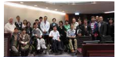
Meeting with the officials of the Registration and Electoral Office

The Registration and Electoral Office scheduled the meeting in the evening of 24 July 2012. It was a historical moment: it was the first time the staff of the Registration and Electoral Office officially met voters of different learning abilities. We had a constructive dialogue, and a letter highlighting our concerns was submitted to the Electoral Office at the close of the meeting.