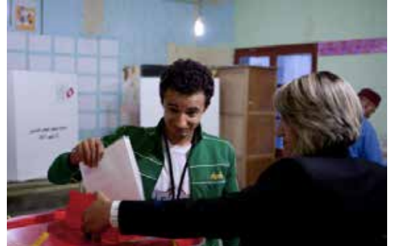
Young member of the OTDDPH casting his vote

Today OTDDPH’s objectives are focused on ensuring the fullest guarantees and rights for persons with disabilities in the Constitution. Currently, we do not know what is the projected timeframe for the adoption of the Constitution, hence we continue advocating at every opportunity to raise awareness of our rights and to ensure that the Constitution enshrines our rights- the rights of all persons with disabilities in Tunisia.