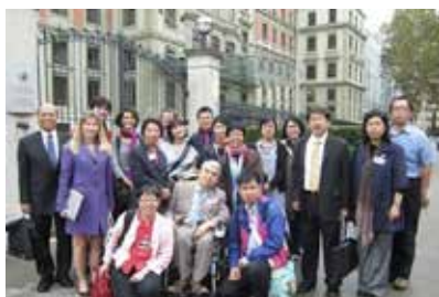
Chosen Power representatives and allies in front of the headquarters of the High Commissioner for Human Rights in Geneva © 2012 Chosen Power

by Chosen Power (People First Hong Kong)