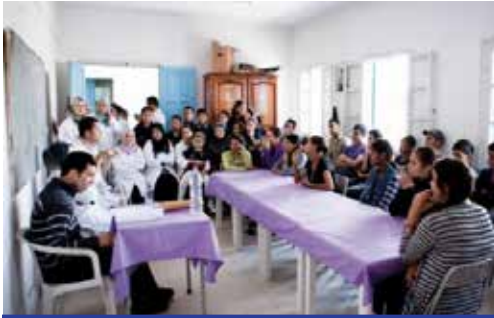
Awareness raising workshop organised by the OTDDPH

Question 4: After decades of autocratic rule, Tunisia prepared for its first free elections in fifty years. How did OTDDPH encourage persons with disabilities to participate?