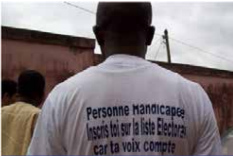
A man wearing a shirt which reads: "Person with disabilities - Register yourself on the electoral list because your voice counts"

The official Elections Procedural Guide by ELECAM highlighted special considerations for persons with disabilities and other vulnerable groups in the entire electoral process. A field on disability was introduced in the voter registration software which led to disaggregation of data by disability, thus allowing the compilation of concrete numbers of participation of persons with disabilities. At the end of the elections, it was noted that 75% of registered voters with disabilities had participated in the elections. This information is central to evaluate the success of the measures taken in the project and to adapt them for increased participation in future elections.