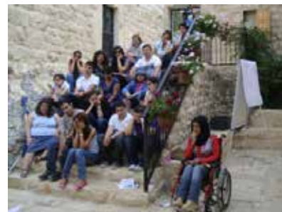
Young members of the Lebanese Association for Self Advocacy

LASA, together with other NGOs, was asked to train electoral officers all over Lebanon on the exercise of the right to vote by persons with intellectual disabilities, including their specific needs for accessibility in the process of voting. Persons with intellectual disabilities were involved in all aspects of the design and execution of the training for self- advocates and parents, and also participated in the meetings with lawyers and roundtables with other actors. Due to a change in government, the activities programmed to train electoral officers were suspended as they were not considered to be a priority by the new Minister of Internal Affairs.