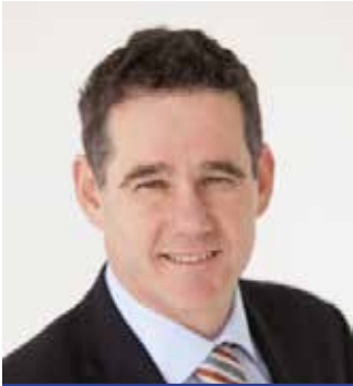
Paul Gibson © 2012 New Zealand Human Rights Commission

The 2012 report of the New Zealand Human Rights Commission (the Commission) entitled Political participation for everyone: Disabled people's rights and the political process , recognises the importance of ensuring disabled people's right to vote and to participate in political and public life.