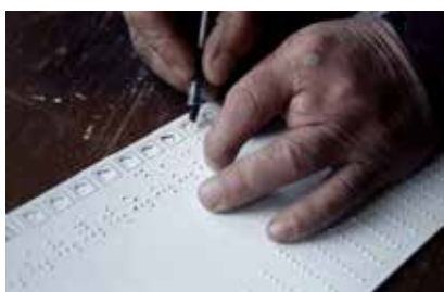
Tactile ballot guide in Kosovo

On election day, persons with disabilities frequently encounter inaccessible polling stations and lack the ability to vote in secret. In Armenia, ramps were built at the most inaccessible polling stations and an information campaign sensitized the public to the rights of citizens with disabilities. In Kosovo, IFES assisted in designing tactile ballot guides so voters who are blind or who have low vision could vote independently and in secret.