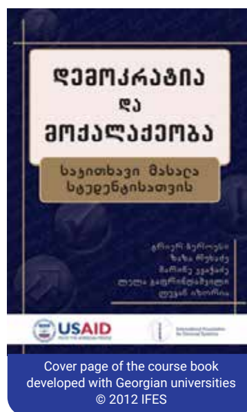
Cover page of the course book developed with Georgian universities

Societies are strengthened when persons with disabilities are equal participants as citizens, voters and candidates, in the political process. With this in mind, EMBs and citizens need to work together and take an active role in ensuring the effective implementation of Article 29 of the CRPD which guarantees "... that persons with disabilities can effectively and fully participate in political and public life on an equal basis with others."