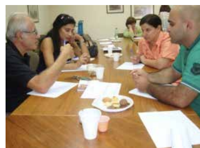
Working groups during training of parents and organizations