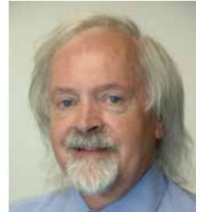
Klaus Lachwitz © 2011 Inclusion International

12 of the Convention on the Rights of Persons with Disabilities (CRPD) which enshrines the right to enjoy and exercise legal capacity.