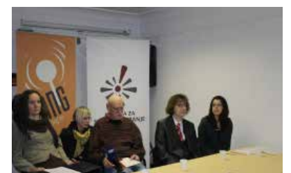
Press conference at the Centre for Human Rights