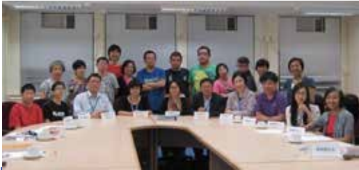
Meeting with the officials of the Registration and Electoral Office

To date a formal complaint has not yet been lodged; we have been informed by the EOC that we need to concretely show how we have suffered loss with respect to the restriction of our political participation due to the lack of accessible information and materials.