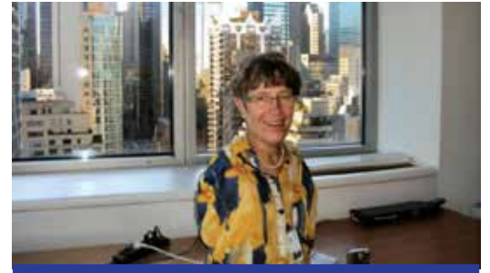
Theresia Degener © 2010

To situate the right to vote and be elected in the context of disability means to consider whether persons with disabilities have equal access to elections and public affairs, whether they are heard and represented inside and outside of parliament and within governmental bodies, from the local to the international level.