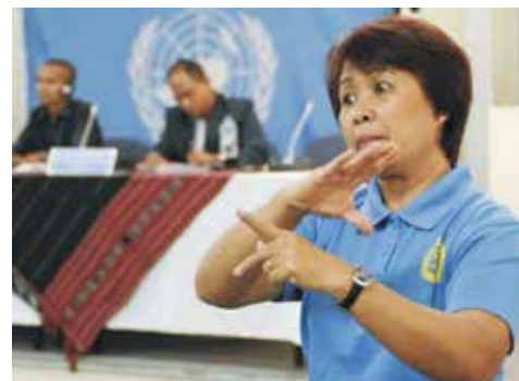
Sign Language interpreter interpreting during the launch of the Report on the Rights of Persons with Disabilities in Timor-Leste

When a person with a disability is elected to a public position, such as Member of Parliament, she or he should be provided with all required support, including personal assistants and additional public funds to cover for disability-related costs.