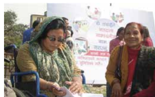
Voters using braille in Nepal