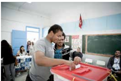
Voting with assistance in the Tunisian elections of 23 October 2011

Question 4: What measures should be taken by States Parties to guarantee that persons with disabilities vote in polling stations like everyone else?